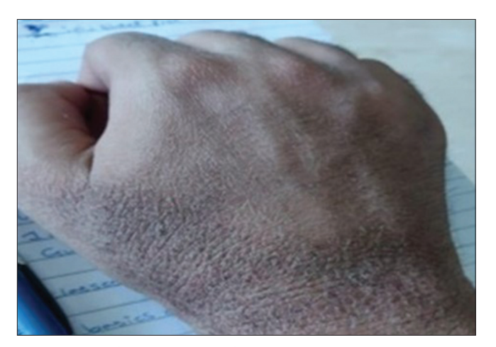
Figure 2: Hand eczema in a student.

the patient. He showed improvement in signs and symptoms with this treatment.