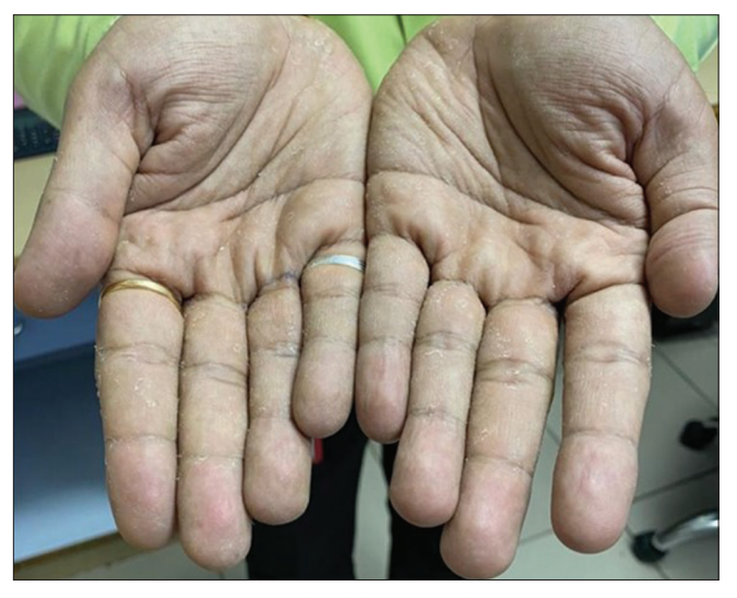
Figure 6: Hand eczema in a health care worker.