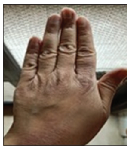
Figure 1: Nummular eczema in a housewife.