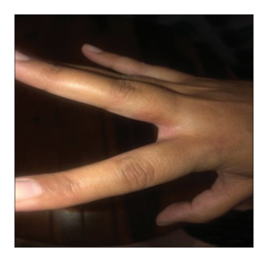
Figure 4: Interdigital hand eczema in a housewife.

history of frequent hand wash (10-12 times a day) and use of hand sanitizer 2-3 times a day as she had a small baby. She had history of atopic dermatitis. On examination, interdigital eczema was observed [Figure 4].