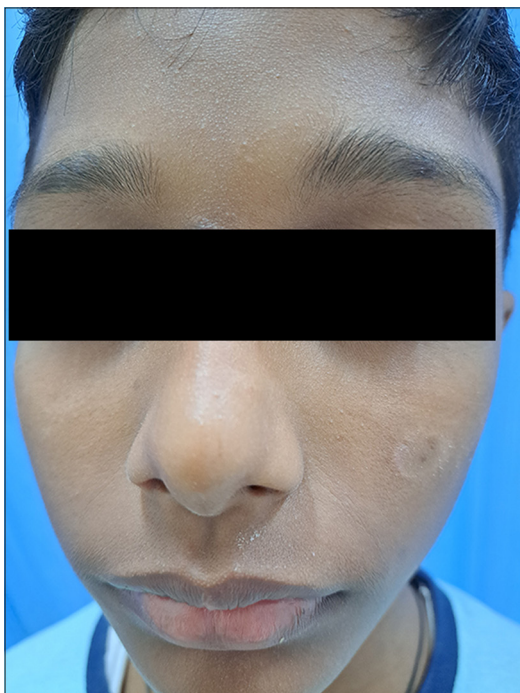
Figure 1: Hyperpigmented scaly plaques over eyelids and photosensitive eczema over cheek of a 9-year-old male patient.