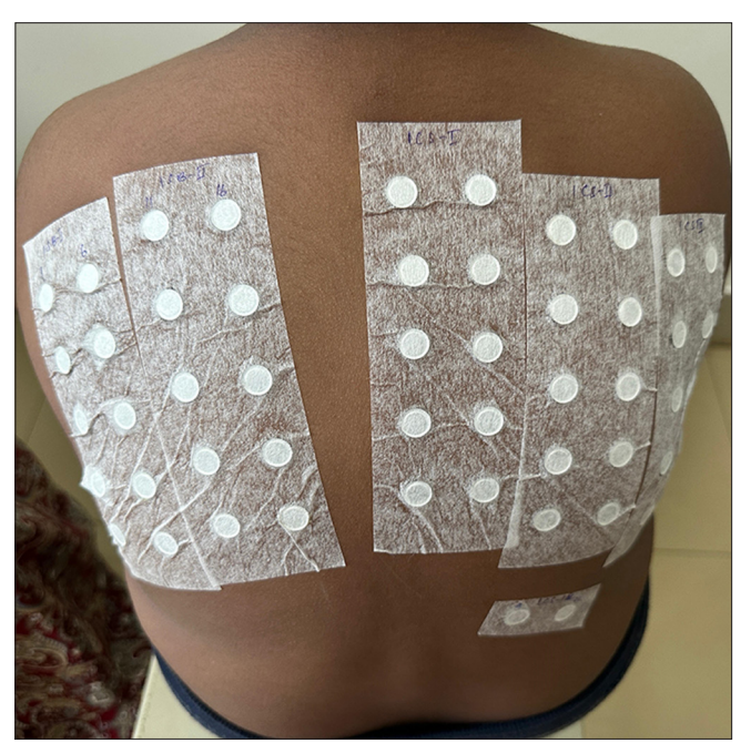
Figure 3: Patch test performed with Indian standard series and cosmetic series over upper back.

going children indulge in various hobbies with materials such as crayons, paints, adhesives, latex, playing clay, slime, nail lacquers, and cement.[11] These materials usually contain colophony, hexamine, and potassium dichromate-like allergens that are often carried by the hands to the perioral and periorbital areas of the face.