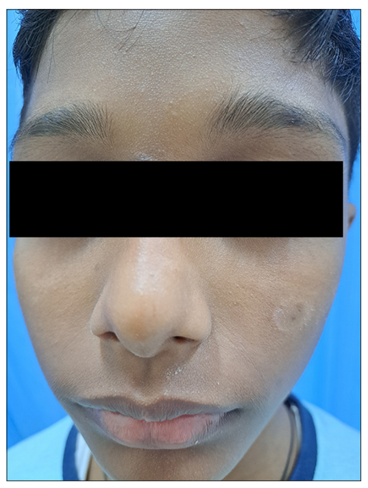
Figure 1: Hyperpigmented scaly plaques over eyelids and photosensitive eczema over cheek of a 9-year-old male patient.