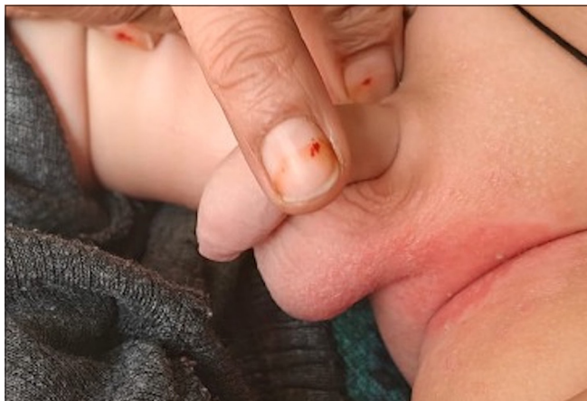
Figure 2: Diaper dermatitis: A common manifestation of irritant contact dermatitis in children.