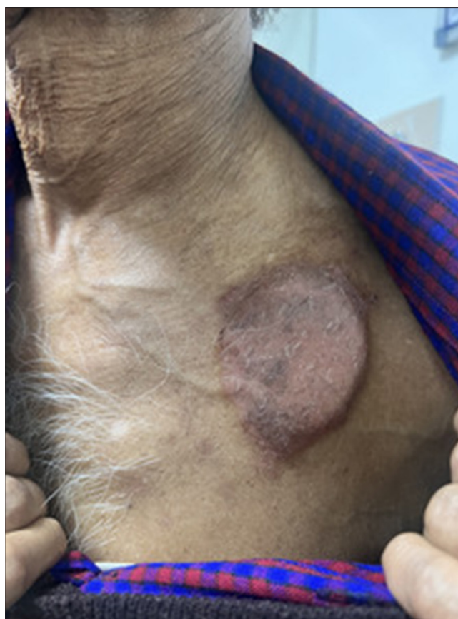
Figure 1: Circumscribed area of dermatitis overlying the area where the cardiac pacemaker – (Dual chamber rate modulated – 3.0T) composed of titanium, chromium, and nickel – was installed.

Although rarely seen, limited cases of pacemaker dermatitis have been described as was reported by Dogan et al. Further, they noted that topical steroids were effective, and no relapse was seen. [2] Ljubojević Hadžavdić et al. reported a case of localized pacemaker dermatitis, which was morphologically similar to local tissue infection, suggesting a need to rule out infections with a tissue swab culture. The components of a pacemaker include a generator and the leads with composite elements of titanium, nickel, polyurethane,