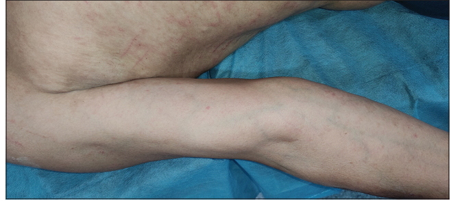
Figure 3: Almost resolved skin eruption after 4 weeks of stopping pembrolizumab.

Although anti-PD-1 medications are usually well tolerated, between 18% and 42% of patients experience cutaneous adverse effects. The most common cutaneous adverse effects among patients receiving pembrolizumab are reported to be maculopapular eruption, pruritus, and hypopigmentation or vitiligo-like lesions. [3,4] Common dermatological adverse events caused by lenvatinib include xerosis, hair and skin discoloration, and palmoplantar dysesthesia. [5] Lenvatinib-induced psoriasiform eruption and palmoplantar erythema in a patient of HCC were first reported by Sally et al. [6] in 2021. A recent report described two patients with psoriasiform rash attributed to nivolumab for stage IV melanoma and to pembrolizumab and TAK-981 for stage IV colorectal cancer. Remarkably, the biopsy findings were an overlap of psoriasiform, spongiotic, and lichenoid dermatitis. The rash cleared partially with apremilast in the first patient, and in the second patient, ixekizumab resulted in a complete resolution. In the present case, a biopsy was not carried out; however, the temporal correlation of the onset of rash after pembrolizumab and the complete resolution after its withdrawal indicates its causality. The patient could be continued on lenvatinib uneventfully.