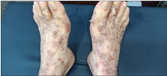
Figure 2: Erythematous whitish scaly, well-defined linearly arranged plaque over the dorsum of feet bilaterally.

patient presented after 4 weeks with significant improvement in terms of resolving erythematous, papules and plaques and pruritus [Figures 3 and 4] and did not have any further episodes on follow-up.