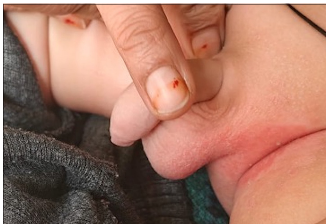
Figure 2: Diaper dermatitis: A common manifestation of irritant contact dermatitis in children.