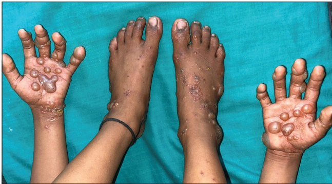
Figure 1: Multiple clear vesicles and tense bullae with erythematous borders, a few crusted papules, and excoriations on the palms, fingers, soles, and dorsae of the feet.

out BP. The final diagnosis of pompholyx was confirmed. The patient was treated with a short course of systemic corticosteroids, topical corticosteroids, and emollients, leading