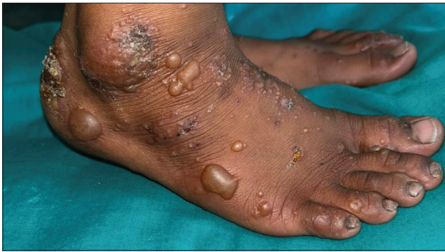
Figure 2: Multiple clear vesicles and tense bullae with erythematous borders, a few crusted papules, and excoriations on the dorsum of the foot.