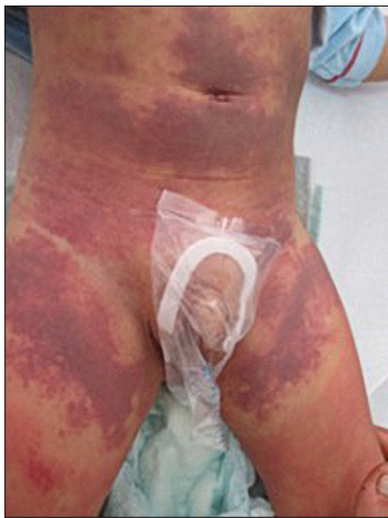
Figure 6: Generalized erythema in DRESS.

extracutaneous organ in children is the liver (affected in >80% of cases). [29]