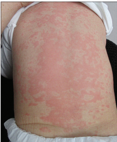
Figure 1: Urticarial drug-reaction type I.

It is a cell-mediated reaction through T lymphocytes; it manifests itself a few hours up to several days after drug exposure. Depending on the clinical manifestations, the pathogenic mechanism, and the latency period, the following entities have been described: maculopapular exanthema, acute generalized exanthematous pustulosis (AGEP), drug hypersensitivity syndrome (DRESS), Stevens–Johnson/Lyell syndrome (toxic epidermal necrolysis), and fixed drug eruption.