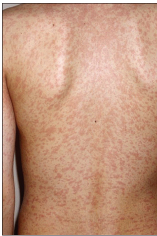
Figure 2: Delayed maculopapular drug eruption.

The classification is made according to the most severe symptoms observed but no symptom is mandatory