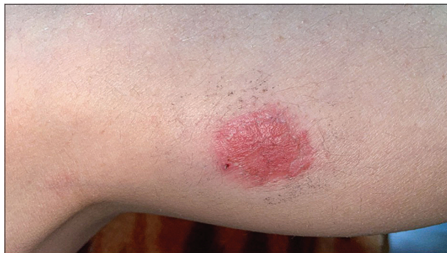
Figure 7: Fixed drug eruption.

impossible. [40] Nevertheless, the in vitro tests may be helpful when available and the interpretation of results is done with a sense of proportion. In addition, none of these in vitro diagnostic tools have a 100% negative predictive value. [41,42] Tables 4 and 5 summarize diagnostic approaches. Drug provocation test is a third-line diagnostic procedure. Risks and benefits should be discussed with the caregivers. The decision should consider the type of drug, severity of drug hypersensitivity reaction, if alternatives to the culprit drug are available and the necessity of drug therapy. The basis of provocation tests is applying the suspected drug substances in the form in which they caused the hypersensitivity reaction. Oral application is preferable compared with intramuscular or intravenous application. [43]