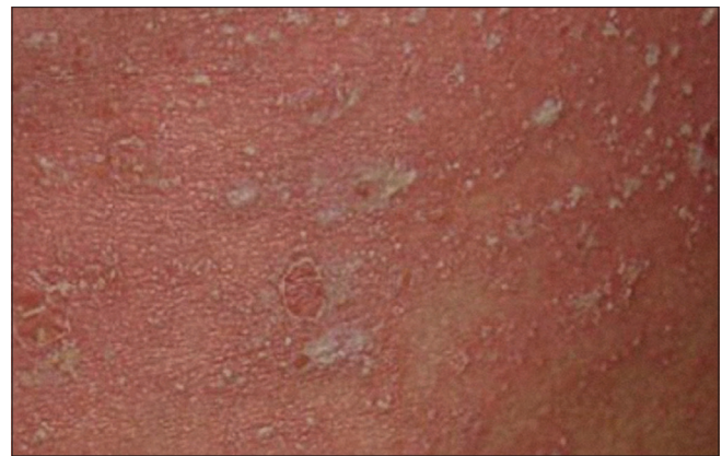
Figure 3: Acute generalized exanthematous pustulosis (AGEP) with multiple pustules, some coalescent, on an erythematous skin.

SJS and TEN are diagnosed primarily clinically. [17,18] These are severe type IV immune reactions, with high mortality, especially at the age of 0–5 years, but with low incidence: 0.5–6.3/100,000 cases, with mortality of 0.3% in case of SJS and 4.2% in case of Lyell syndrome. [19,20] SCORTEN is a risk