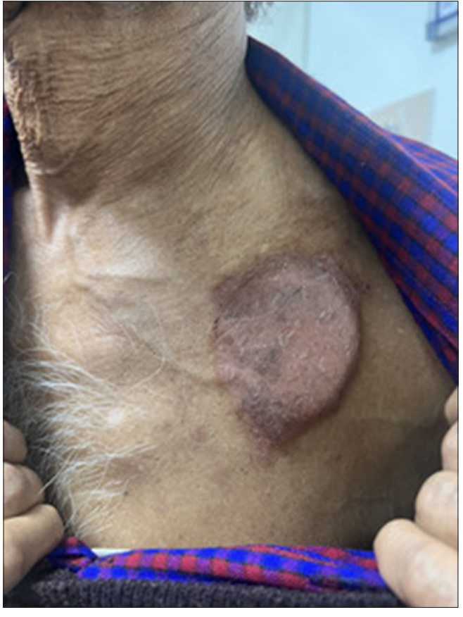
Figure 1: Circumscribed area of dermatitis overlying the area where the cardiac pacemaker – (Dual chamber rate modulated – 3.0T) composed of titanium, chromium, and nickel – was installed.

epoxy, mercury, cadmium, chromium, silicon, and cobalt. Of these, nickel is the most frequently culpable.<sup>[3]</sup> Previously reported cases have shown full resolution with the removal of the metal implants. Pacemaker hypersensitivity may show severe systemic features as was seen in an 80-year-